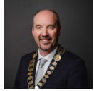
MAYOR BRYAN PATERSON Mayor